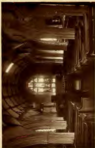
NO. 3. INTERIOR OF MADRON CHURCH.