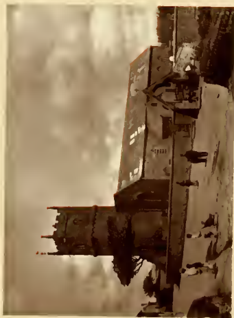
NO. 2. MADRON CHURCH.